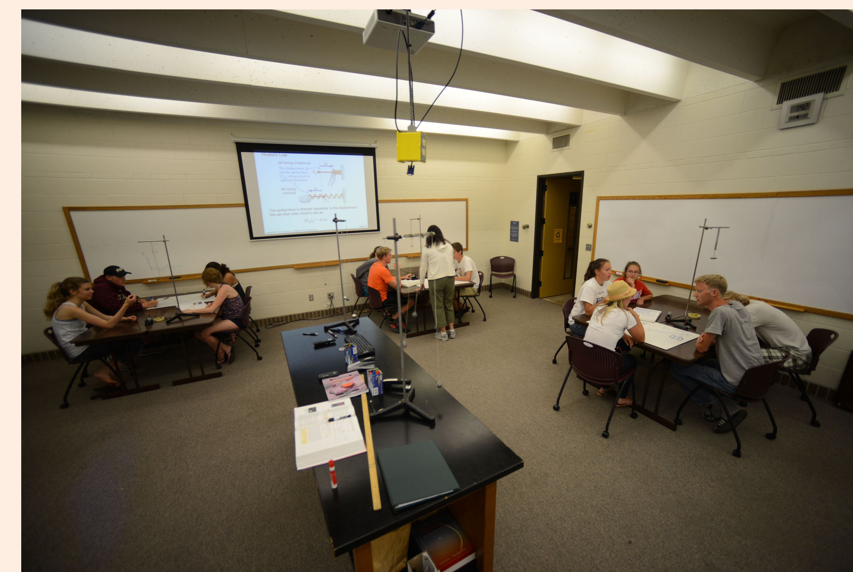
Photo of Studio Physics Classroom layout.

*no standardized content survey was use to asses the PHY 211 or 112 courses.